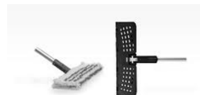
Double mop (microfiber)