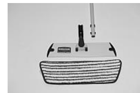
Single mop (microfiber)