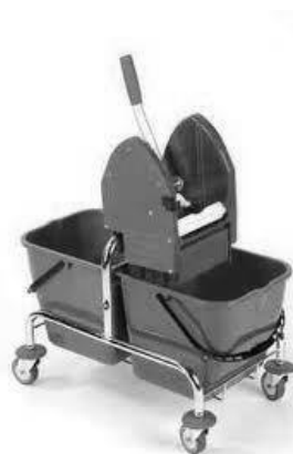
Double bucket cart