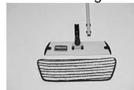
Single mop (microfiber)