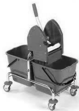
Double bucket cart